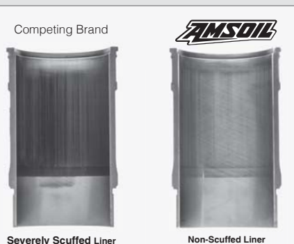
Detroit Diesel DD13 Scuffing Test for Specification DFS 93K222