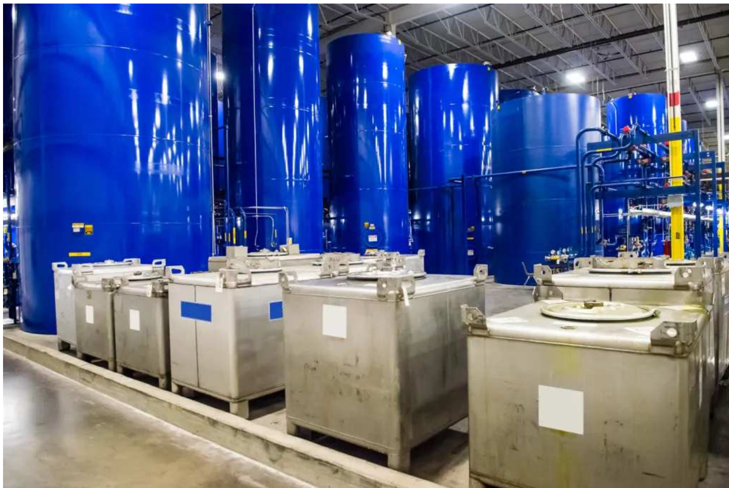
Raw materials and finished product are stored in the “tank farm” which in total accounts for 2.4 million gallons.