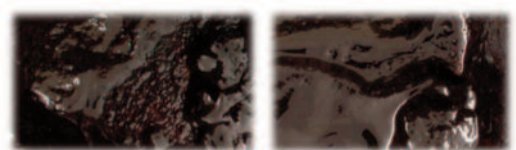
Low tier oil: High temperature oxidation drives viscosity increase and sludge deposits