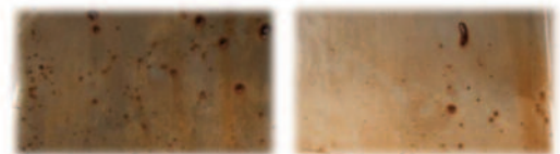
High tier oil: No significant sludge deposits