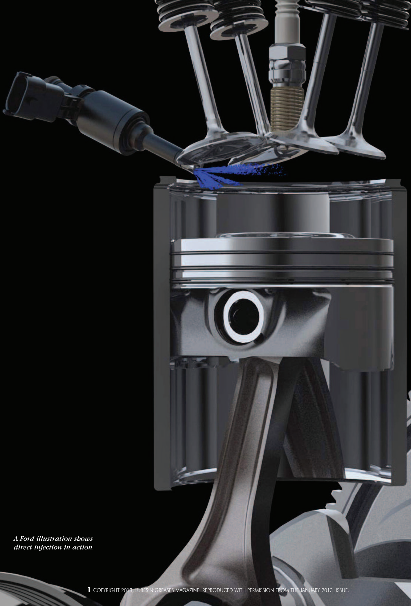
A Ford illustration shows direct injection in action.